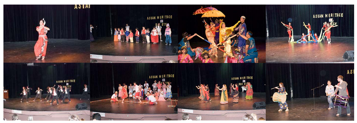
Local Asian Performers at 2008 Gala Night

Department of Canadian Heritage Immigration and Population Growth Secretariat City of Fredericton