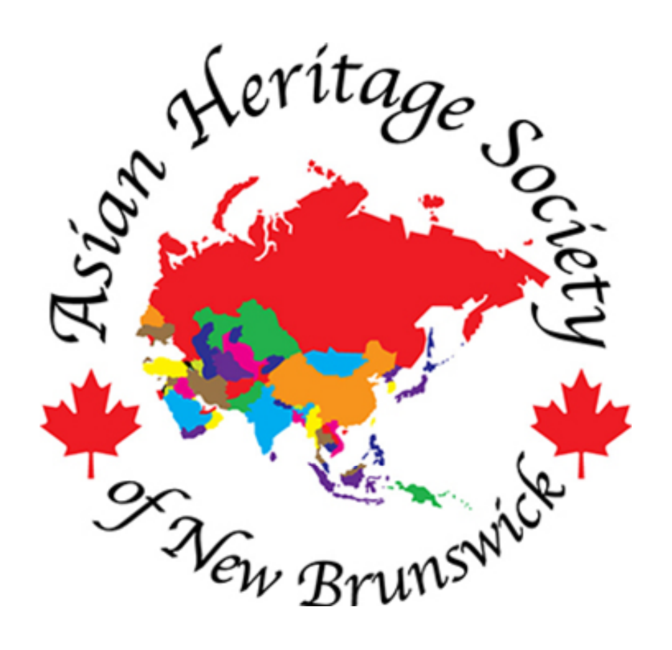
Asian Heritage Society of New Brunswick Annual Report 2008